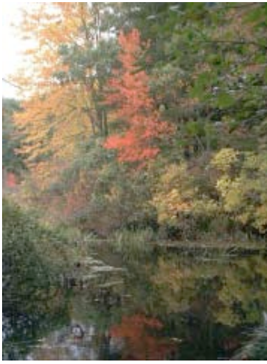
Wapping Road Property: Jones River, Agricultural field, Scenic views, Forest and Uplands